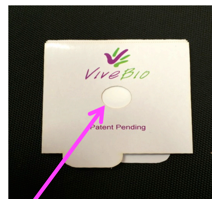
Blood is added to the entry port